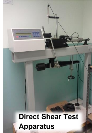
Direct Shear Test Apparatus