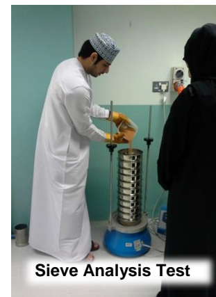
Sieve Analysis Test