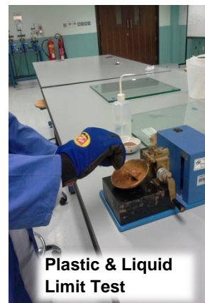
Plastic & Liquid Limit Test