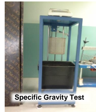
Specific Gravity Test