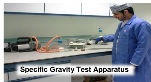
Specific Gravity Test Apparatus