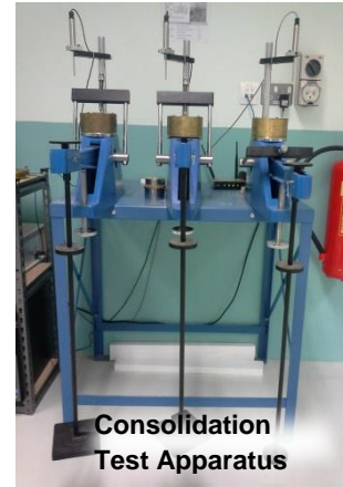
Consolidation Test Apparatus