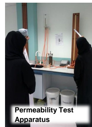
Permeability Test Apparatus